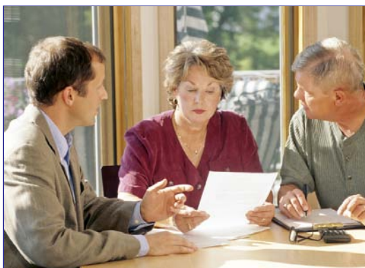
Let MTL provide you with friendly, professional, and easy-to-follow advice to help you plan for the future.

We encourage you to book an appointment with your local Mennonite Trust Ltd. branch for a consultation to discuss any questions or concerns you may have.